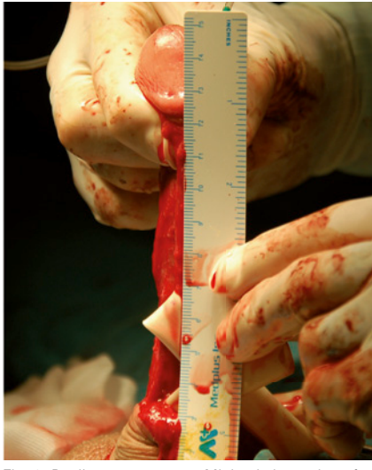
Fig. 8. Penile measurement. Minimal shortening of the penis

Ten patients with congenital penile curvature and 60-90 degrees ventral curvature have been operated between jun-2009 and jun-2011 in my department by rotating the corpora cavernosa and using this modified technique. More than 90 % penile straightening was observed in all cases, with minimal shortening of the penis (0.5-1 \, \text{cm.}) , with high patient satisfaction, and without postoperative complications.