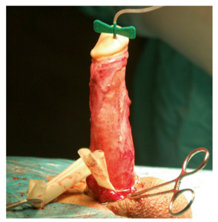
Fig. 7. Artificial erection with excellent penile staightening